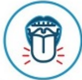
DISTORTION OF SENSE OF TASTE