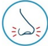
LOSS OF SENSE OF SMELL